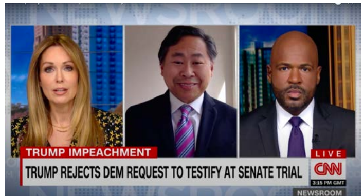
Trump Impeachment Issues CNN Weekend Newsroom – Christi Paul & Victor Blackwell