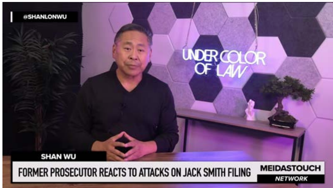
Jack Smith DROPS BIG BOMB in Trump Criminal Filing Meidas Touch