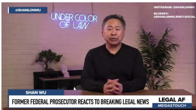
Trump CORRUPT SCHEME Gets BLOWN WIDE OPEN Legal AF