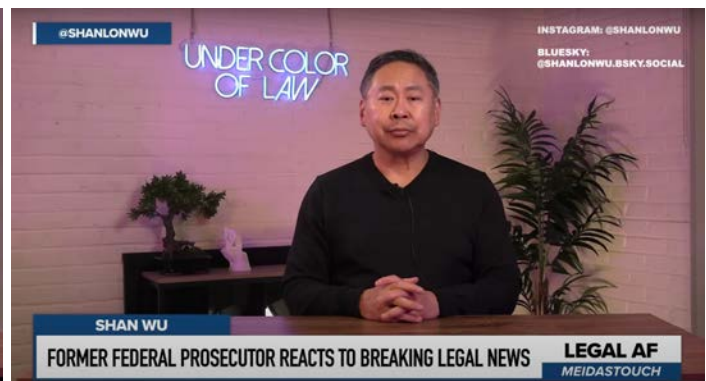
Dems Finally OUTMANEUVER Trump with PERFECT RESPONSE Legal AF