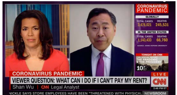
Covid-19 Pandemic Questions CNN Newsroom – Fredricka Whitfield