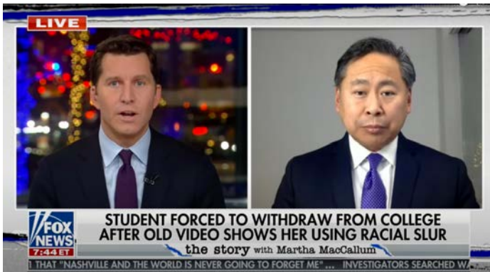
“Cancel Culture” Cheerleader Expelled from University of Tennessee FOX News