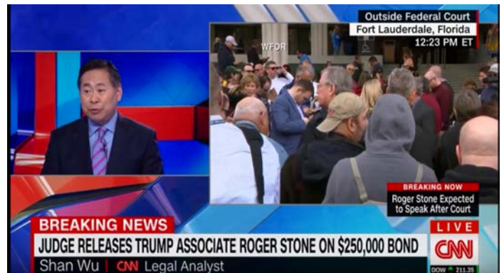
Roger Stone’s Tattoo Inside Politics – John King