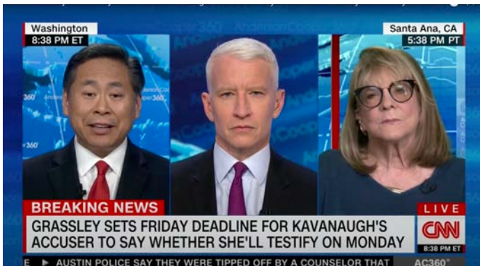
Sexual Assault Allegations Against Justice Brett Kavanaugh AC360 – Anderson Cooper