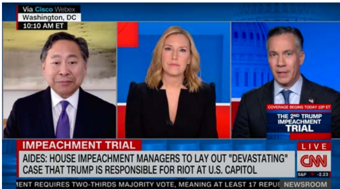
“Visual & Visceral!” Evidence at Trump Impeachment II CNN Newsroom – Poppy Harlow & Jim Sciutto