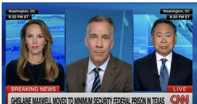
Ghislaine Maxwell Transferred to Low-Level Minimum Security Camp CNN Newsroom – Jim Sciutto