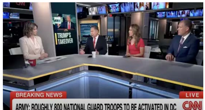
Trump's Takeover of DC CNN Newsroom – Kasie Hunt