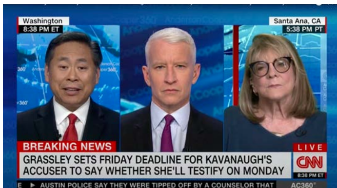
Sexual Assault Allegations Against Justice Brett Kavanaugh AC360 – Anderson Cooper