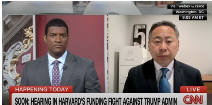
Trump vs. Harvard CNN Newsroom – Omar Jimenez