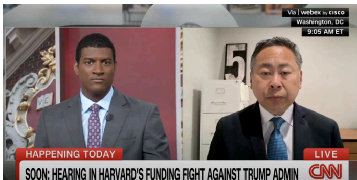
Trump vs. Harvard CNN Newsroom – Omar Jimenez