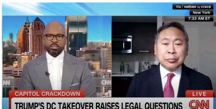
Is Trump's Takeover of Washington, DC Law Enforcement Legal? CNN Newsroom – Victor Blackwell