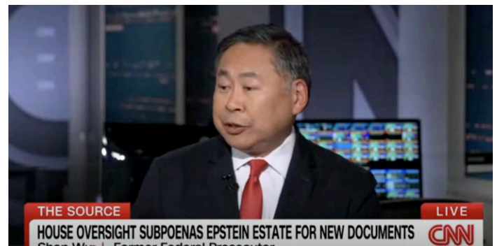
Epstein/Flag Burning/The Federal Reserve CNN's The Source – Brianna Keilor