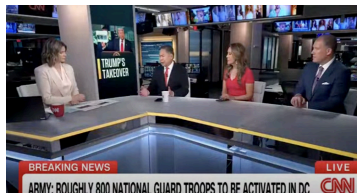
Trump's Takeover of DC CNN Newsroom – Kasie Hunt