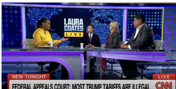
Trump's Tariffs & Efforts to Pack the Federal Reserve CNN - Laura Coates Live